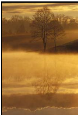
Shimmering Sunrise Holley Green