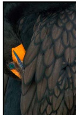
Cormorant Wing Jack Nevitt