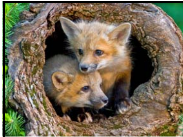
Looking For Trouble Jack Nevitt