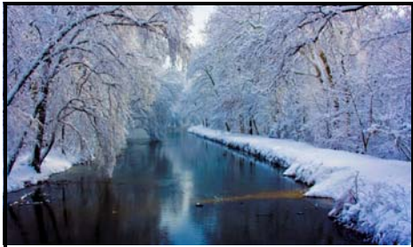
Snowy Canal Greg Daily

Following are the images selected by the members present at the March 6 meeting for MWCC's submission to the Glennie Nature Exhibition conducted by the Merrimac Valley Camera Club of the New England Camera Club Council.