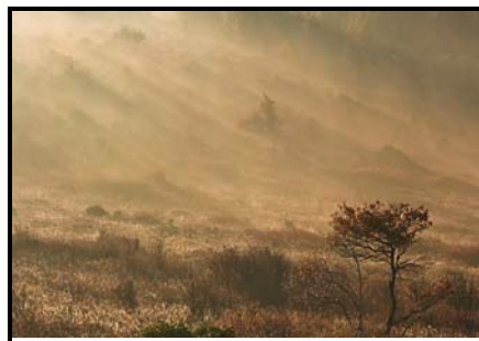
Sunrays from Heaven Greg Daily