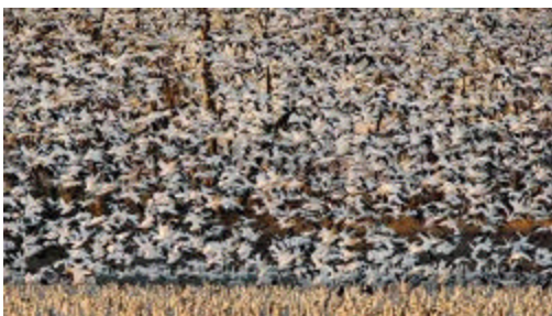
2007 Best of Show "Bombay Hook"

The Meadowlark Nature Photography Expo provides a growing audience an opportunity to see some of the finest photography in the world in a two day event at the Washington area's premier event facility. Six Northern Virginia camera clubs, with over 600 members, combine to display their works along with a variety of sponsors. The event typically draws in 2,000 visitors from Washington, D.C., Maryland, Virginia and beyond --- all anxious to learn more about photography and the beauty of our natural world.