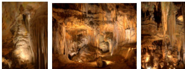
Luray Caverns Summer Field Trip

That's it for this month. Have a great year, and remember, "Have Fun and Take Pictures".