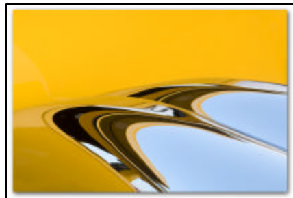
Air Induction by Karen Rexrode

Longwood Gardens is located in Pennsylvania, a 3 hour drive from Northern Virginia. Their conservatory is 5 acres large and a fabulous place for photography. Here is their link: http://www.longwoodgardens.org/ The overnight hotel is the Hilton Garden Inn http://hiltongardeninn.hilton.com/en/gi/hotels/index.jhtml;jsessionid=R5H000PWXHLSKCSGJBC3EWQ?ctyhocn=PHLKSGL